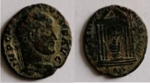
Nummus Empereur Maxence 308-310 ap. JC Collection Dominique Cirey

The town has very few traces of the Gallo-Roman era, unlike some of its neighbors. The remains of a Gallo-Roman villa had been updated at the end of the 19th century, in Bellicout, but nothing remains and we do not know from what century it dated, or even if artifacts (objects shaped by humans) were found on the site. Objects from the same period had been unearthed at La Touche and Ligné. After the conquest by Julius Caesar, the Pax Romana (the 200 year old period of peace in the Roman Empire) settled in the area known as Roman Gaul, which quickly became one of the most prosperous provinces of the Empire. In 27 BC, Augustus founded the province of Gaul in Aquitaine, the first capital of which was Mediolanum