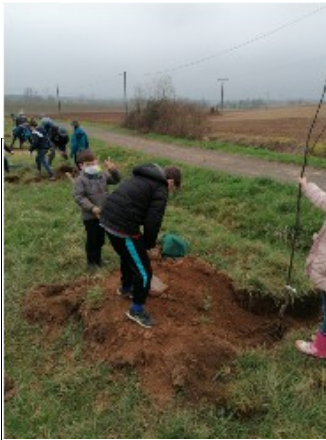
4 – To Plant

The correspondent of Charente Libre came to get information for an article to appear in the local daily paper.