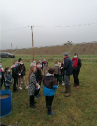
1 – To listen