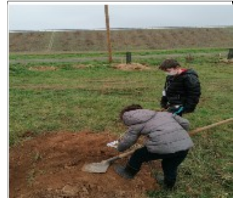
2 - Digging