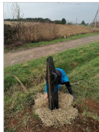
6 – To mulch

In the afternoon, about fifteen residents of Charmé met at 2 p.m. in front of the stadium to plant the hedges.