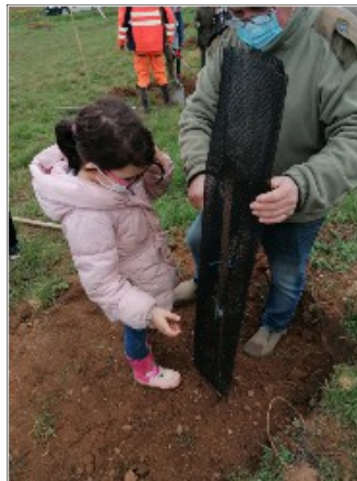
5 – To protect